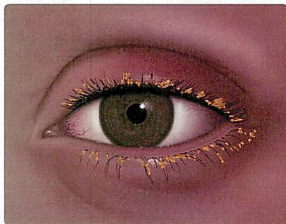
With blepharitis, the eyelids become coated with oily particles and bacteria near the base of the eyelashes.

Blepharitis is when you have bacteria and oily flakes at the base of your eyelashes. Your eyelids are red, swollen, or feel like they are burning. Blepharitis is very common, especially among people who have oily skin, dandruff or dry eyes.